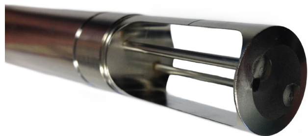
DDC-Sensor™ shown in closeup with weld mark detail on the bottom of the RTD window highlights non-cantilevered design.

The Fox Thermal DDC-Sensor™ is a new state-of-the-art sensor technology used in the FT1, FT4A, and FT4X flow meters. The DDC-Sensor™ is a Direct Digitally Controlled sensor that is interfaced directly to the microprocessor for more accuracy, speed, and programmability. The DDC-Sensor™ accurately responds to changes in process variables (gas flow rate, pressure, and temperature) which are used by the microprocessor to determine mass flow rate, totalized flow, and temperature.